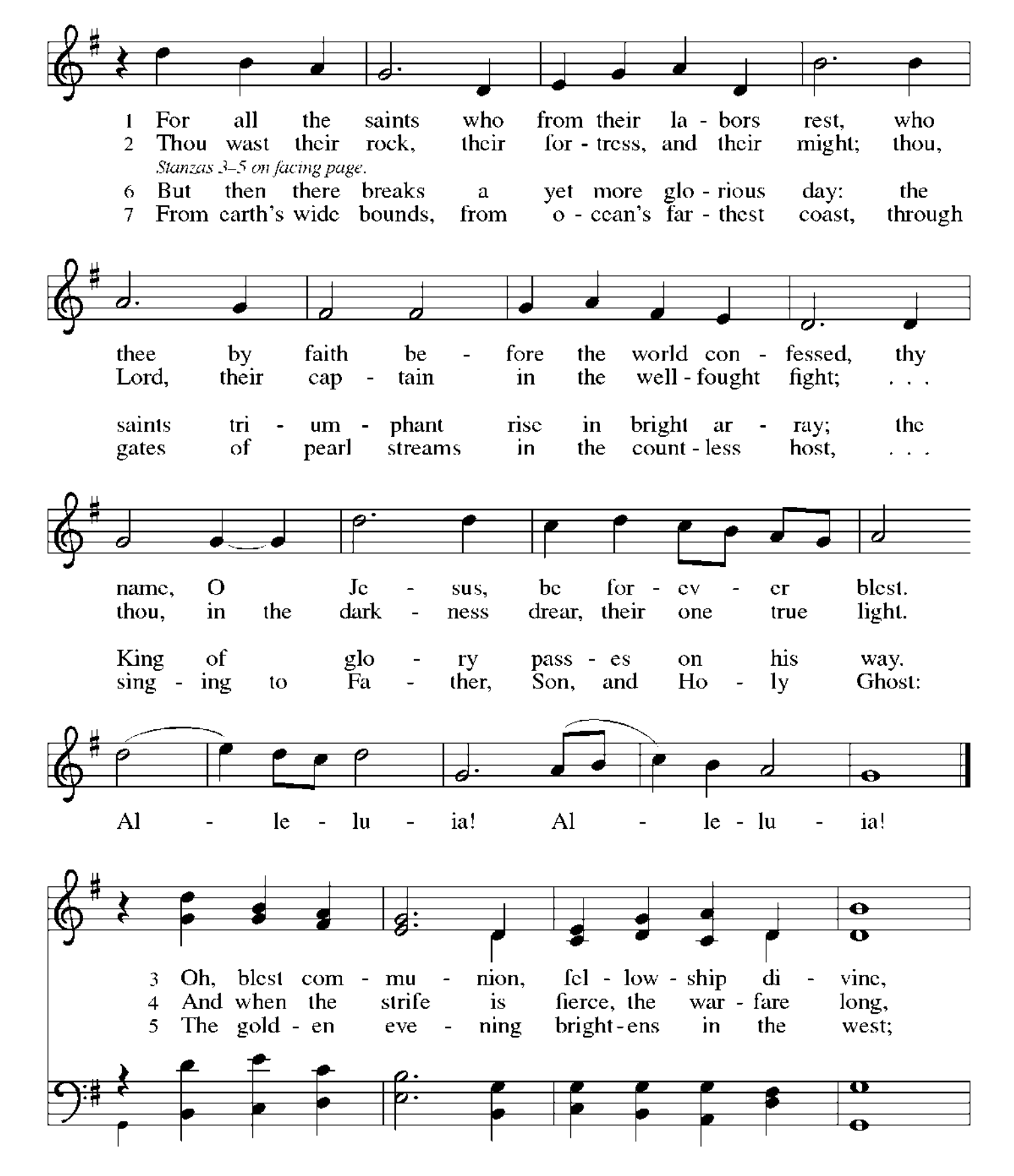
For All the Saints