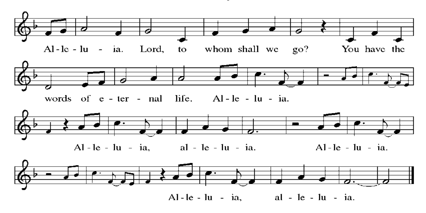
Please stand as you are able.